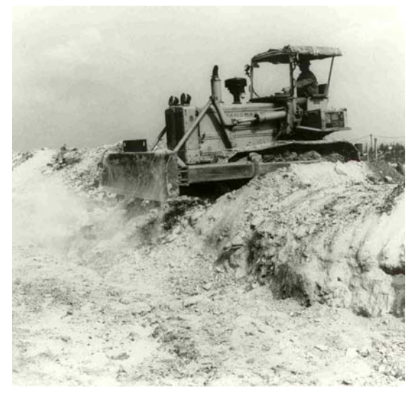
Stockpiles of toxic HCH waste isomers left over from lindane production.

dimethicone lotion, a substance with a long-chain linear silicone base that acts through physical means that will not be affected by resistance to neurotoxic insecticides.<sup>30</sup> Dimethicone lotion has been shown to be more effective than malathion and permethrin treatments in recent observer blinded studies.<sup>31,32</sup> Another article in the journal Pediatrics reported that the use of Cetaphil cleanser was 96% effective and had a 94% long-term cure rate with no toxicity. Cetaphil cleanser was found to have cure rates exceeding those of permethrin, malathion, "Bug Busting" (particular type of mechanical removal used in the UK), and dimethicone.<sup>33</sup>