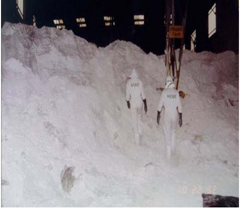
Workers in a lindane factory. For every ton of lindane that is produced, nine tons of toxic waste is discarded.<sup>43</sup>

in sex hormone levels in the blood.<sup>4</sup> The estrogenic effects of HCHs, including lindane, have been found in both animals and humans. In a nested case-control study conducted in Spain, maternal exposure to organochlorine lindane associated pesticides including is with cryptorchidism and hypospadias in their sons.<sup>5</sup> In women. HCH exposure has been linked to breast cancer and cancers of the reproductive tract. Beta-HCH accelerates the appearance and incidence of malignant breast tumors in mice.<sup>6</sup> It has also been shown to act as a breast cancer promoter in human breast cells.<sup>7</sup> A recent study in Jaipur, India found that blood lindane and organochlorine pesticide levels were significantly higher in women with cancers of the reproductive tract than in the control group.<sup>8</sup> The International Agency for Research in Cancer (IARC)