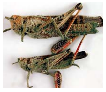
Plague locust ( Chortoicetes terminifera) covered with Metarhizium anisoplia fungal spores.

pesticide based on the acridid-specific fungal pathogen, Metarhizium anisoplia var. acridum , which presents a viable alternative to chemical pesticides to control locusts.<sup>89</sup> IMI 330189, the strain of Metarhizium anisoplia var. acridum most studied for its ecological risks and efficacy was developed by the international research project LUBILOSA ( Lutte Biologique contre les Locustes et Sauteriaux ) and is currently commercially available under the trade name Green Muscle®. The CSIRO ( Commonwealth Scientific and Industrial Research Organisation ) developed another strain, also commercially available known as Green Guard®.<sup>90,91,92,93</sup> Metarhizium anisoplia var. acridum has successfully been shown to be effective in controlling the Desert Locust ( Schistocerca gregaria ),<sup>94</sup> the Red Locust ( Nomadacris septemfasciata ), Migratory Locust ( Locusta migratoria )<sup>95</sup> and