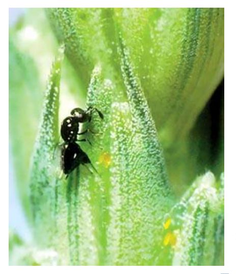
Macroglenes penetrans , egg-larval parasite of the wheat midge.

Integrative Pest Management (IPM) strategies have been incorporated in countries such as Canada and the United States to control populations of the wheat midge. Crop rotation deters the buildup of midge populations in the soil when wheat fields are replaced with crops not susceptible to midge, such as oilseeds, soybeans, flax, beans, lentils, chickpeas, and pulse crops