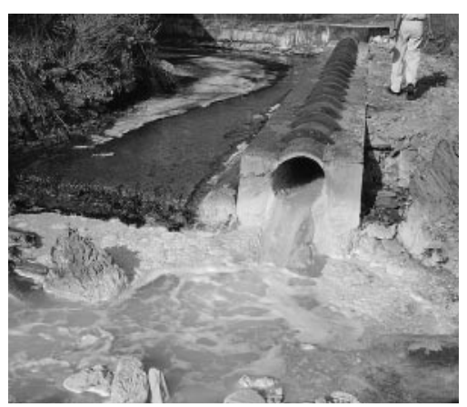
Kanoria Chemicals and Industries Ltd's effluent discharge pipeline into Donki Nala River in India.

Our findings demonstrate that one 30-minute application of hot air has the potential to eradicate head lice infestations. In summary, hot air is an effective, safe treatment and one to which lice are unlikely to evolve resistance. There were no adverse effects of treatment.<sup>24</sup>