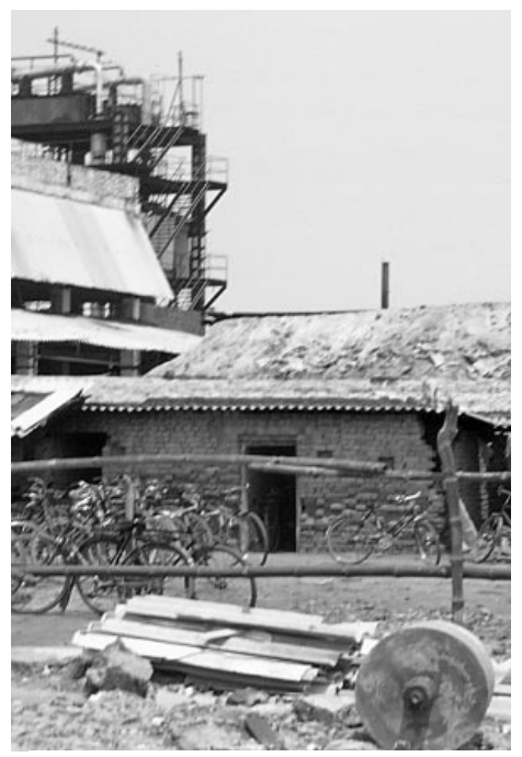
India Pesticides Limited's "Muck Yard" seen behind the plant. Worker's shed and cycle stand is located right next to the yard.

With the banning of lindane, many countries have established alternative methods to effectively prevent harm to seeds and crops in lieu of the use of lindane. The noninsecticidal strategies currently known include: crop rotation where a non-host species is planted to reduce the damage of infestation and maintain low levels of pests; site selection and monitoring to determine if a crop-damaging pest is present; fallowing the area for a few years before planting to starve the pests; careful seed selection and reseeding with resistant crops; timing of seeding and planting; zero or reduced tillage regimes; increasing seeding rates; shallow seeding; good seed to soil contact; balanced fertility levels to ensure that plants are not predisposed to disease; avoidance of excessively wet seed